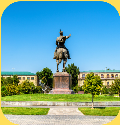
Amir Timur Square

A beautiful country filled with stunning landscapes, rich history exquisite artistry & warm hospitality.