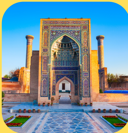
Amir Temur Mausoleum