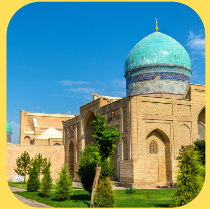
Hazrat Imam Ensemble

Tashkent • Samarkand • Bukhara • Khiva • Tashkent